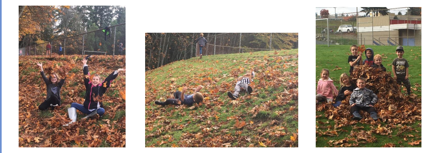
Just some old fashioned fall fun playing/rolling in the leaves!