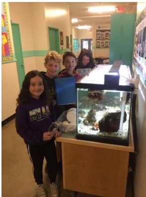
'Budding Marine Biologists'