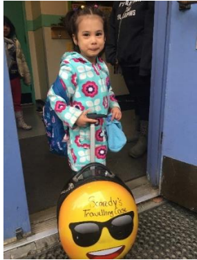
Kindergarten Highlight – taking Scaredy Squirrel Home!