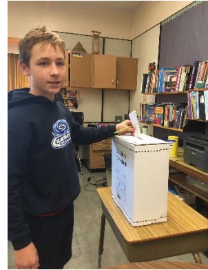
At the ballot box casting votes @ Cilaire!