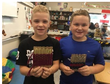
Salish Woven Pouch (process and product) Div. 4