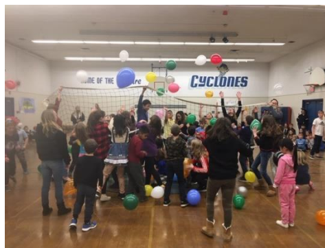
Balloon Volleyball Challenge

Dec. 9-13 – Purdy's Pick up in office Dec. 12 – Christmas Concert , 1:00pm & 6:00pm Dec. 20 – Last Day of school before Winter Break Jan. 6 – School back in session from Winter Break Feb. 7 – Progress Reports Home Feb. 17 – Family Day, no school Feb. 24 & 25 – Prod D Days, no school March 16 – March 27 – Spring Break March 30 – Back to school after spring break