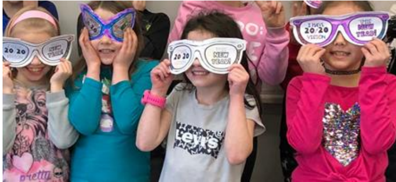
These kids have '20/20' Vision This New Year!