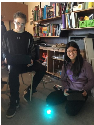
Spheros – Coding and Problem Solving at it's best!