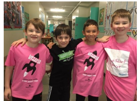
Lift Each Other Up – Pink Shirt Day