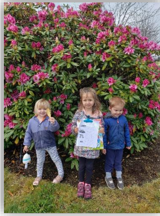
Kindergarten Walking Graph Project (awesome sibling teamwork!)