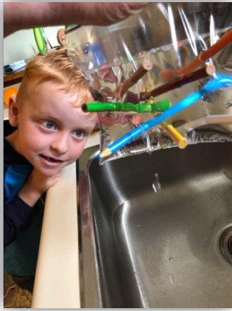
Grade One Science Experiment