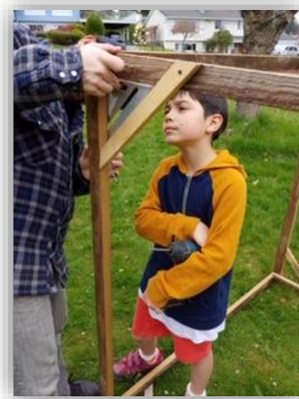
Learning about Angles